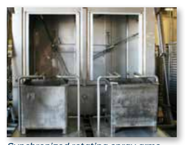
Synchronized rotating spray arms clean the vats' interior and exterior